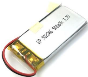
Lithium-Ion Polymer Cell