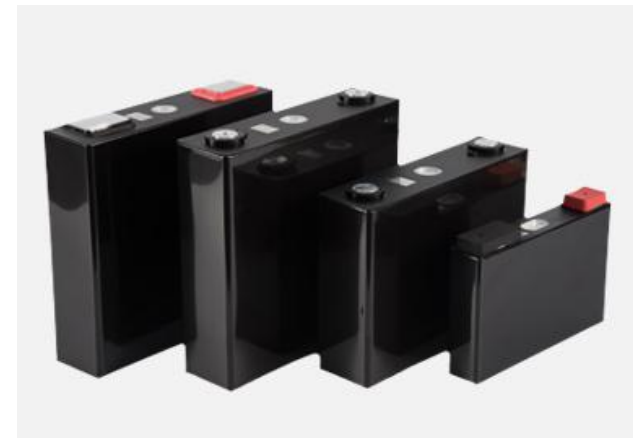
Lithium -Iron Phosphate Cell