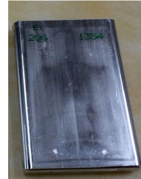
Lithium -Ion Prismatic Cell