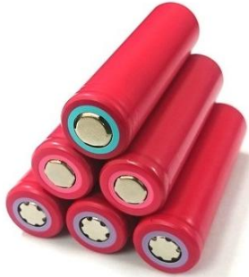
Lithium -Ion Cylindrical Cell